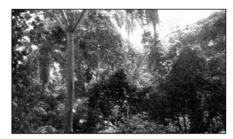
The Abuko Forest Nature Reserve is an environmentally sensitive remnant of the Gambia's original forest cover. It could suffer from climate change and falling water tables.