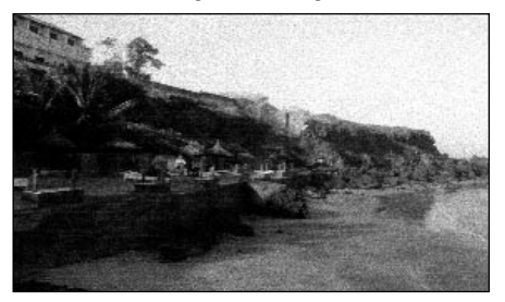
Evidence of severe coastal erosion along the main hotel strip fronting the Atlantic Ocean. The impact of an infrastructure and tourism could be significant.