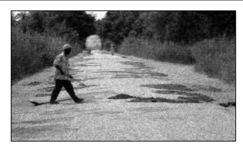
Most Gambian roads are earth or gravel surfaced and liable to damage, especially in the rainy season.