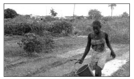
Intensive, small-scale farming for fruit and vegetables, typical of land use at the Sukuta site, supporting a large number of villagers.