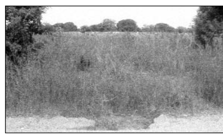
Scrub and savannah, the result of forest clearance and grazing, is typical of the landscape at the Airport site.