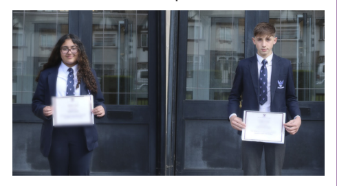
WELCOME TO DRAYTON MANOR Year 6

Year 10 Students - Awarding of Year 11 Ties It is always a proud moment at the school when we can recognise the outstanding Ambition, Character and Civic Virtue of our students. This term, we awarded Year 11 ties to 60 Year 10 students in recognition of their commitment to their school community through volunteering with school activities and supporting their fellow students. Congratulations to students for their hard work. We look forward to our next celebration when school starts in September.